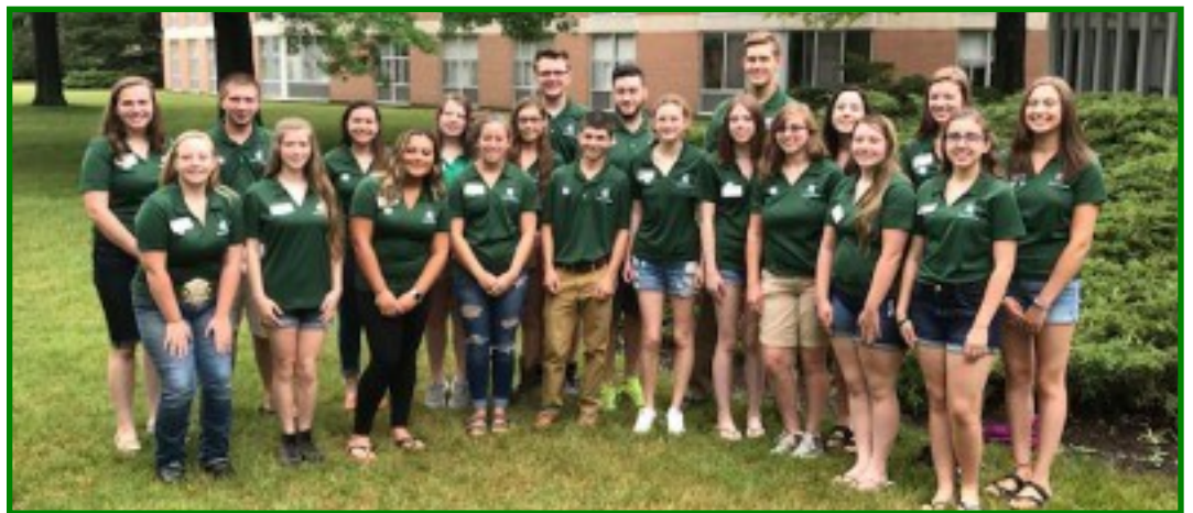
Members of the 2017 Michigan 4-H State Youth Leadership Council

Members of the Michigan State 4-H Youth Leadership Council met weekly throughout 2017 to give Michigan 4-H youth a voice and to develop 4-H youth promoters and spokespeople. The youth meets virtually and works on developing planning, goal setting, public speaking, communication, facilitation and networking skills. Two of the 26 youth serving on the Michigan 4-H State Youth Leadership Council in 2017 were from Montcalm County. Through MSU Extension the Michigan 4-H program is helping to develop youth as current and future leaders by providing programs such as the Youth Leadership Council, that instill young people with the knowledge and skills to become positive agents of change.